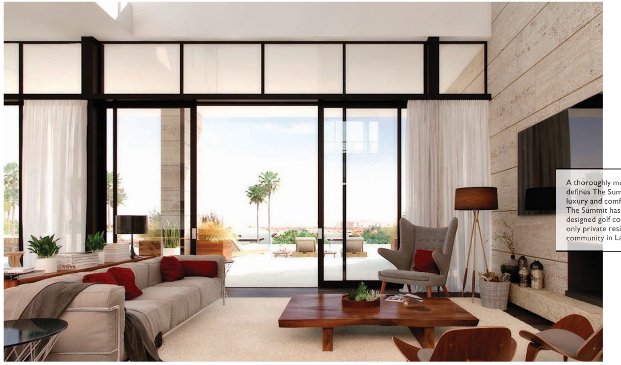
A thoroughly modern aesthetic defines The Summit, where luxury and comfort converge; The Summit has a Tom Fazio-designed golf course and is the only private residential golf community in Las Vegas.

sticker shock," he says. "The value of these lots was something Vegas had never seen before. But after getting over that, buyers have been showing up in flocks to acquire property and build their dream homes."