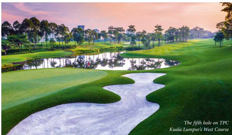
The fifth hole on TPC Kuala Lumpur's West Course

The project is set to commence this November following the Sime Darby LPGA Malaysia tournament at TPC Kuala Lumpur.