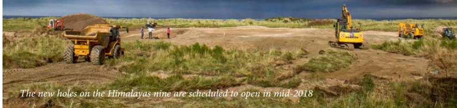
The new holes on the Himalayas nine are scheduled to open in mid-2018

Changes include the amalgamation of the former second and third holes to create a new long par five hole, and the introduction of a new hole following the existing fifth hole.