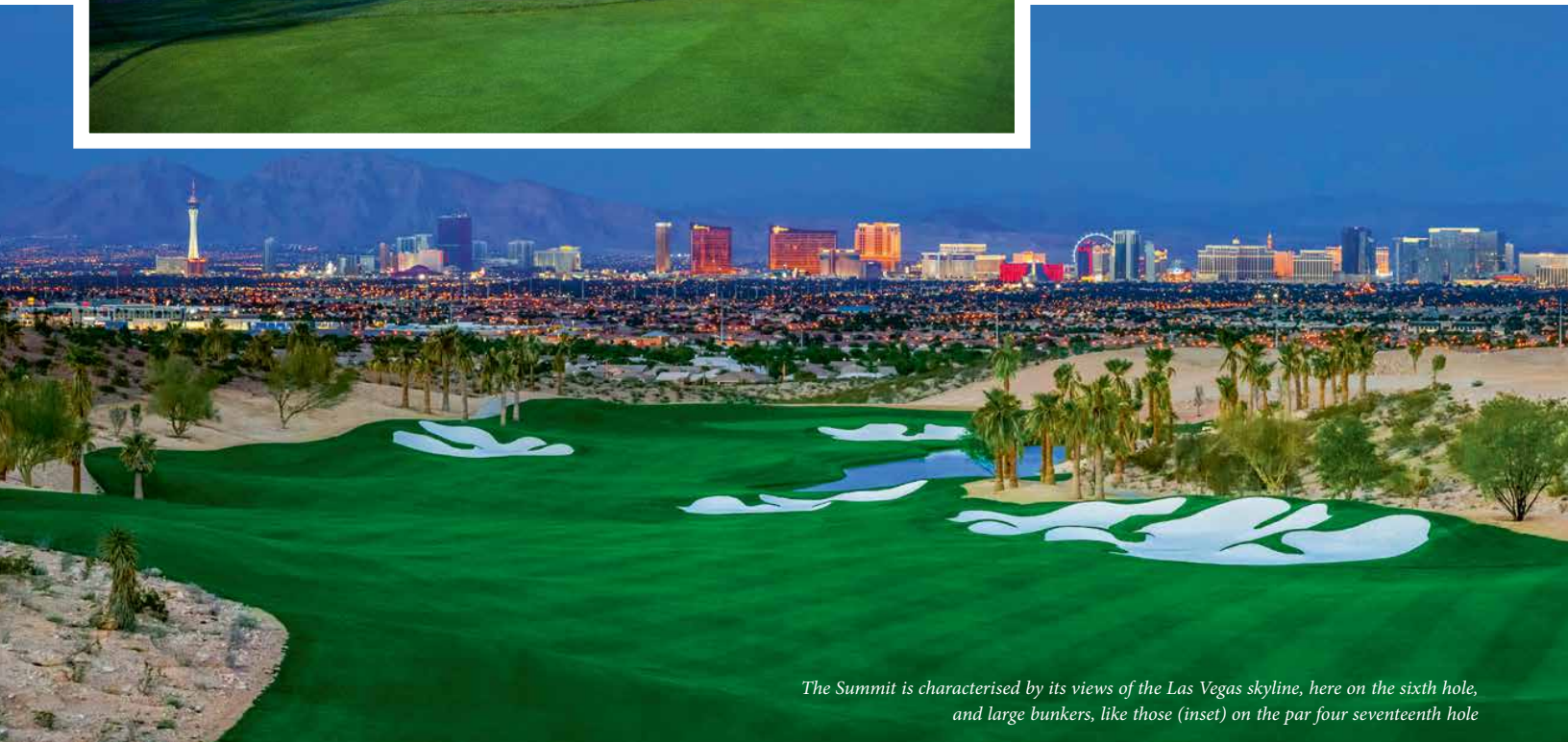
The Summit is characterised by its views of the Las Vegas skyline, here on the sixth hole, and large bunkers, like those (inset) on the par four seventeenth hole